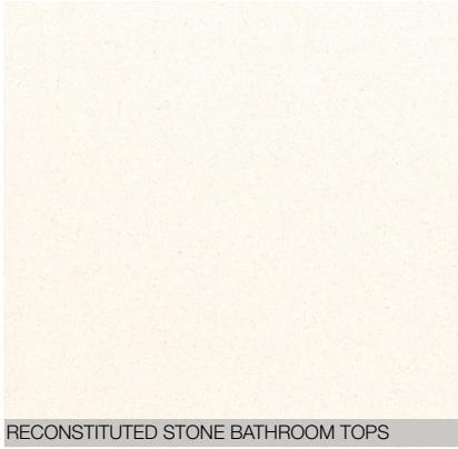
RECONSTITUTED STONE BATHROOM TOPS