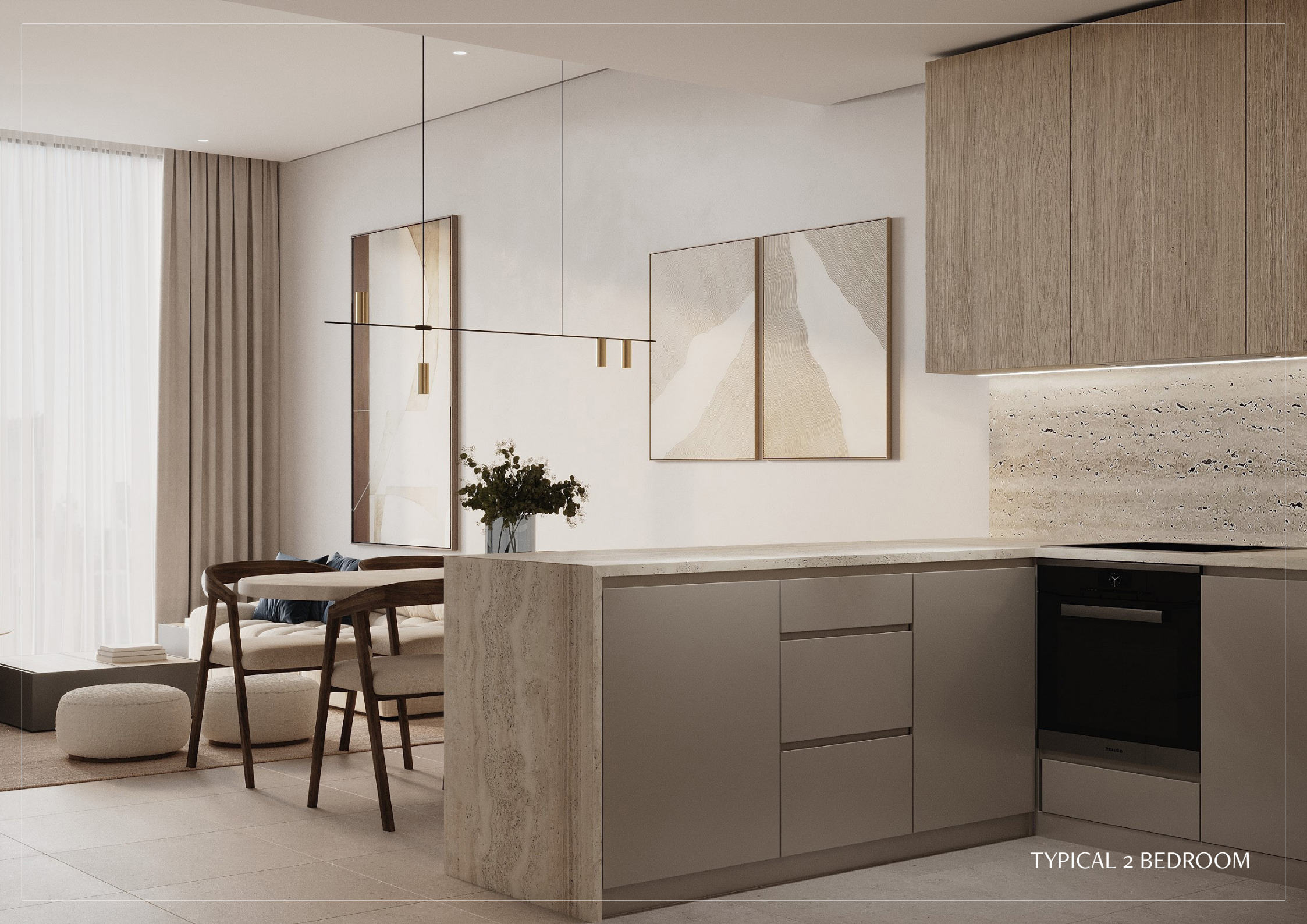
TYPICAL 2 BEDROOM