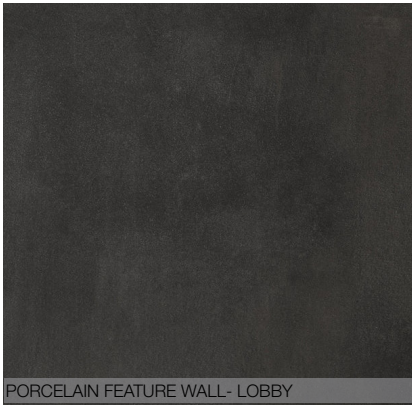
PORCELAIN FEATURE WALL - LOBBY