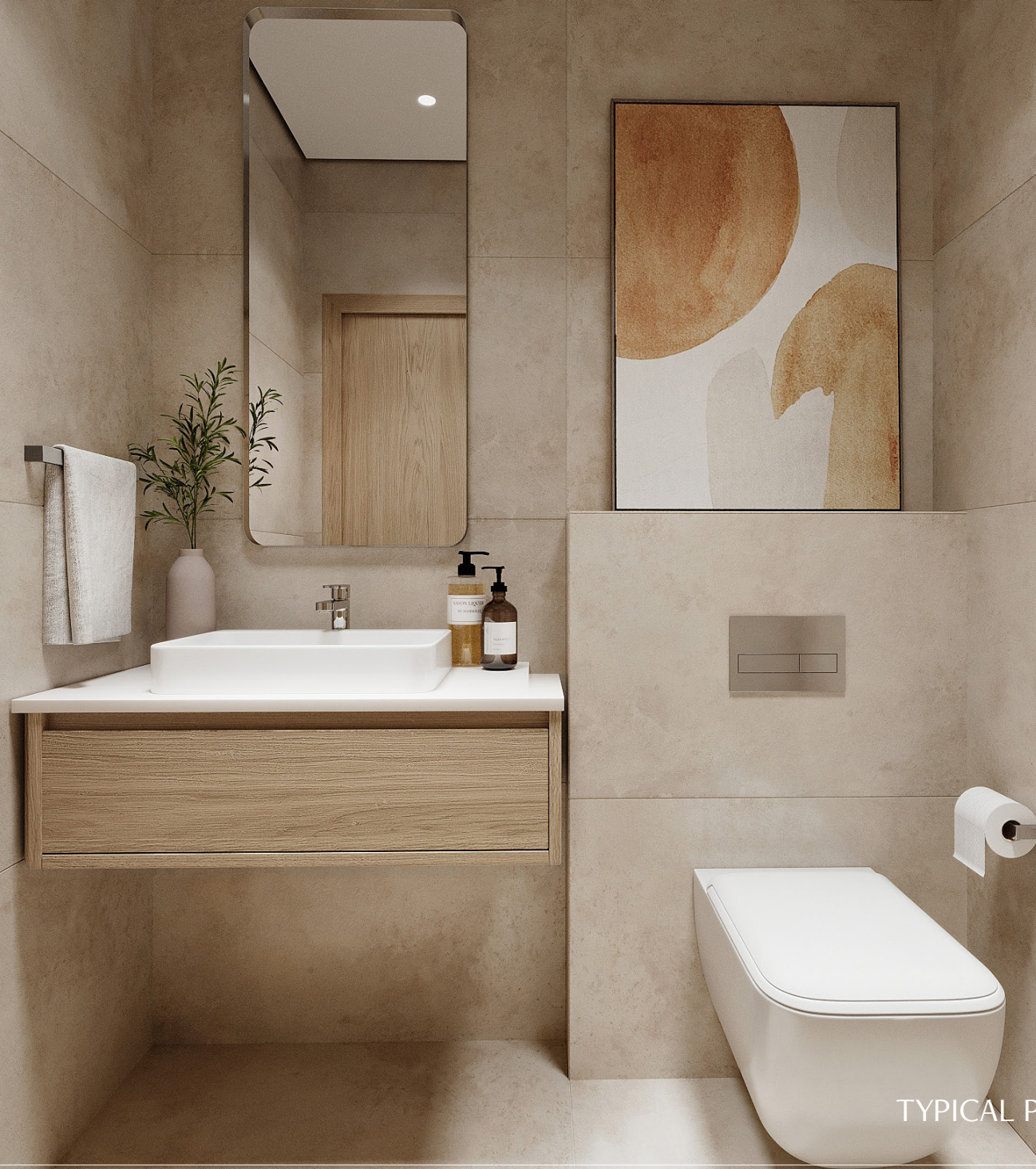
TYPICAL POWDER BATHROOM 02