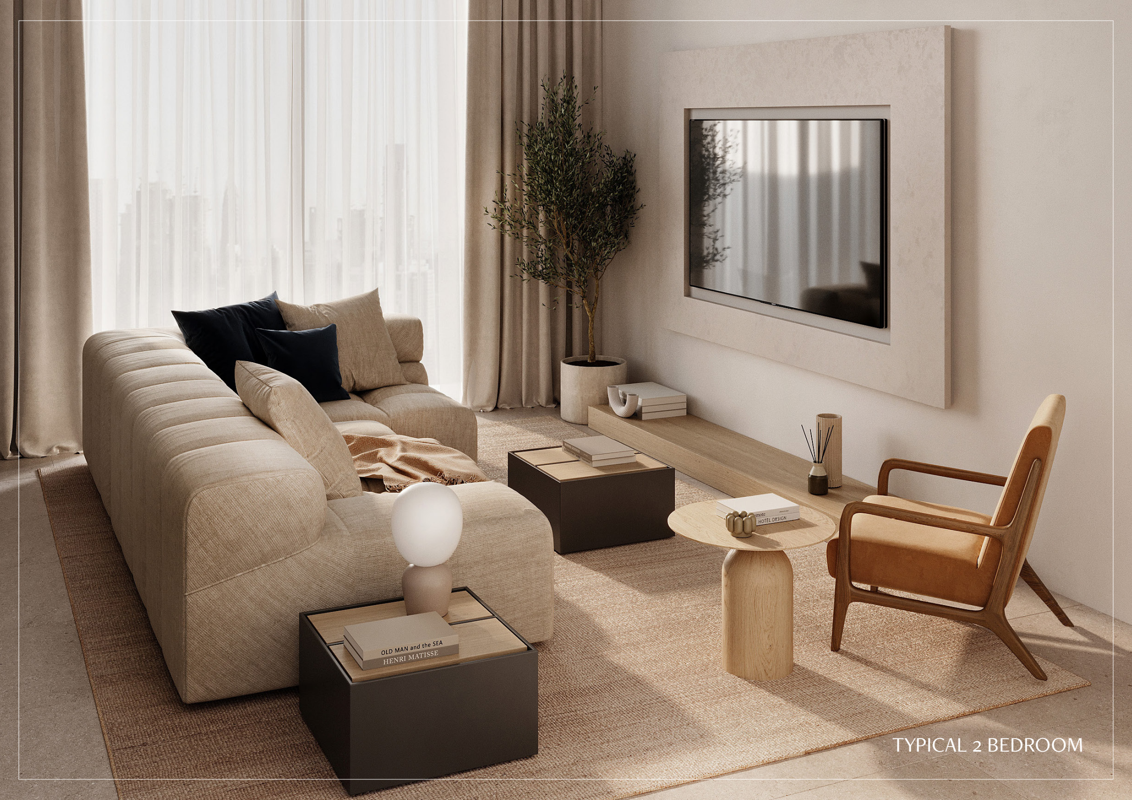
TYPICAL 2 BEDROOM