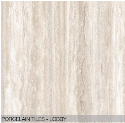
PORCELAIN TILES - LOBBY