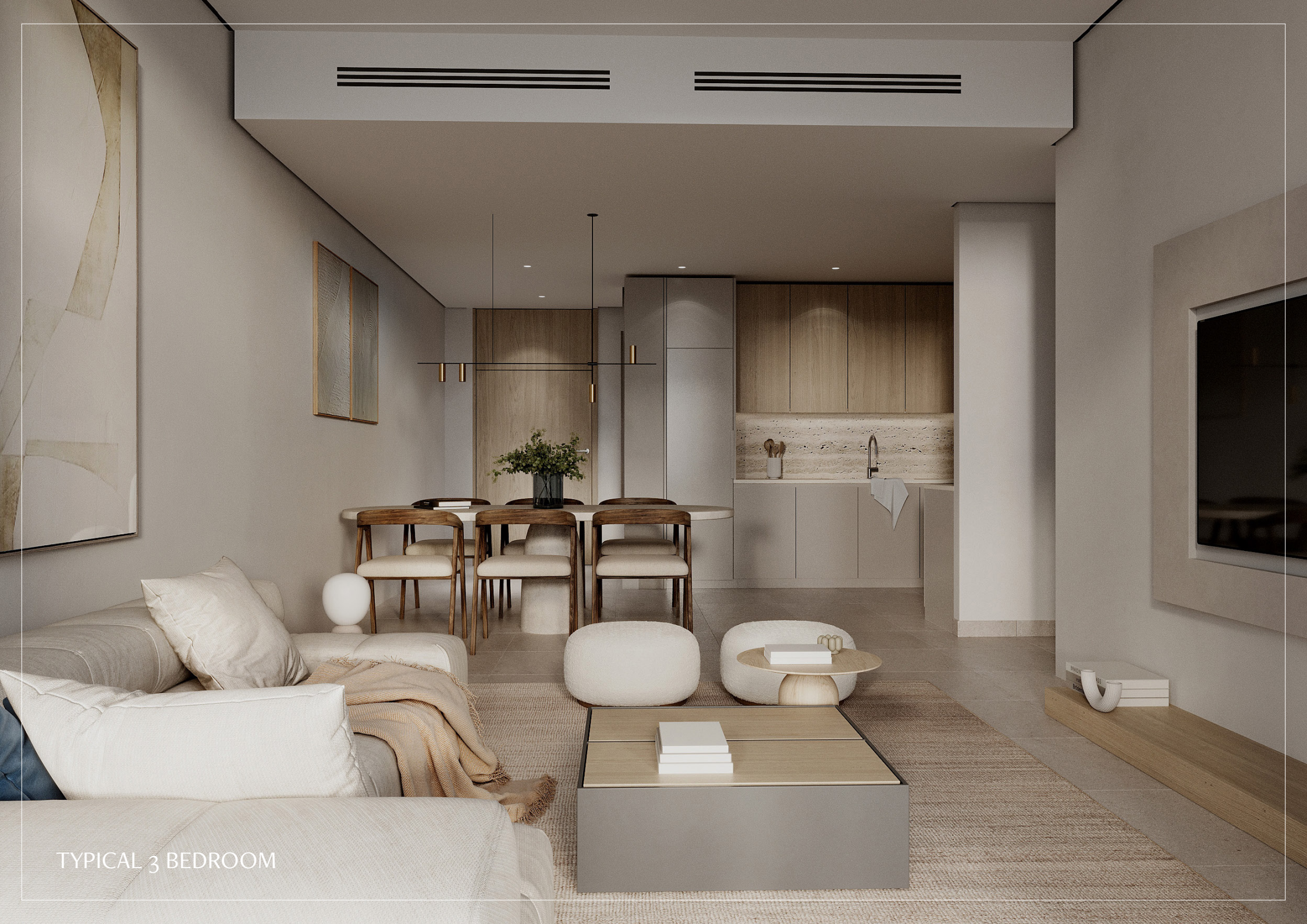
TYPICAL 3 BEDROOM