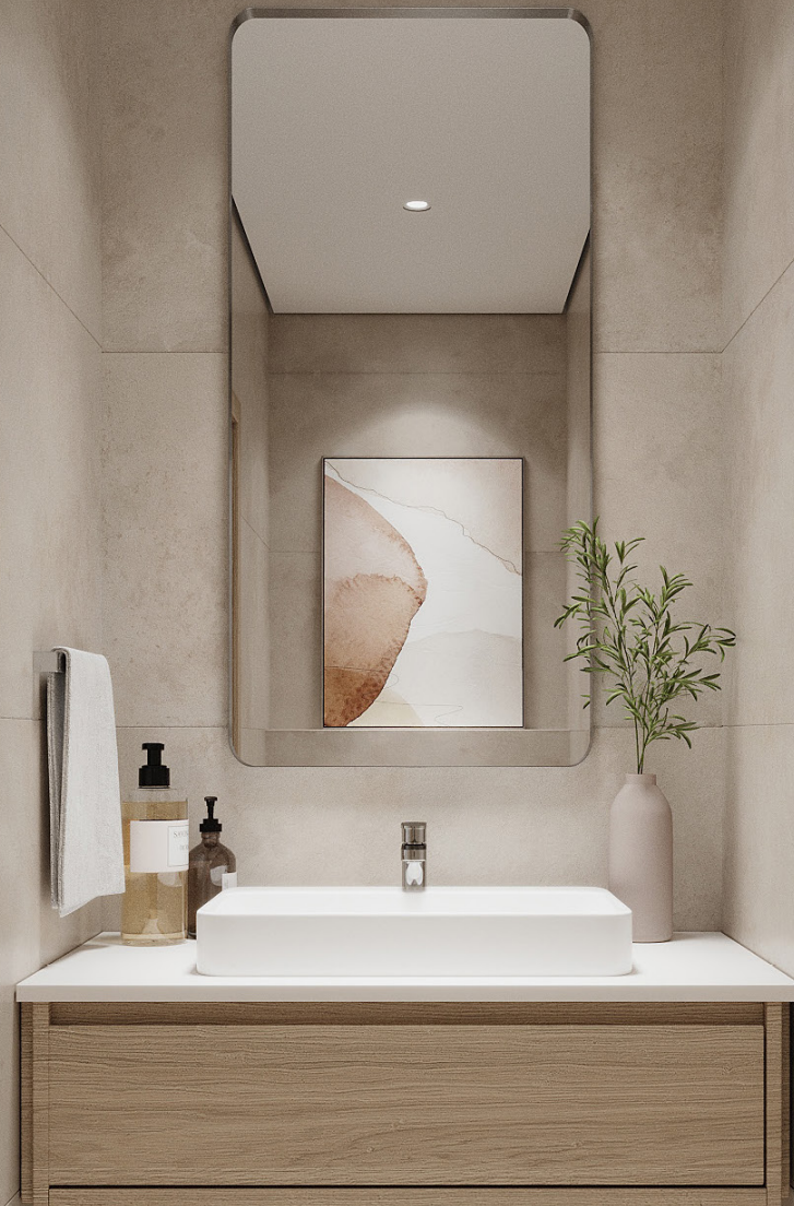
TYPICAL POWDER BATHROOM 03