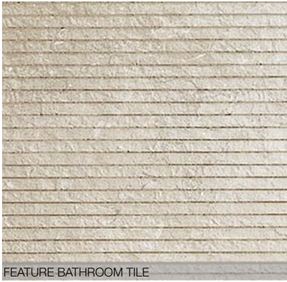
FEATURE BATHROOM TILE