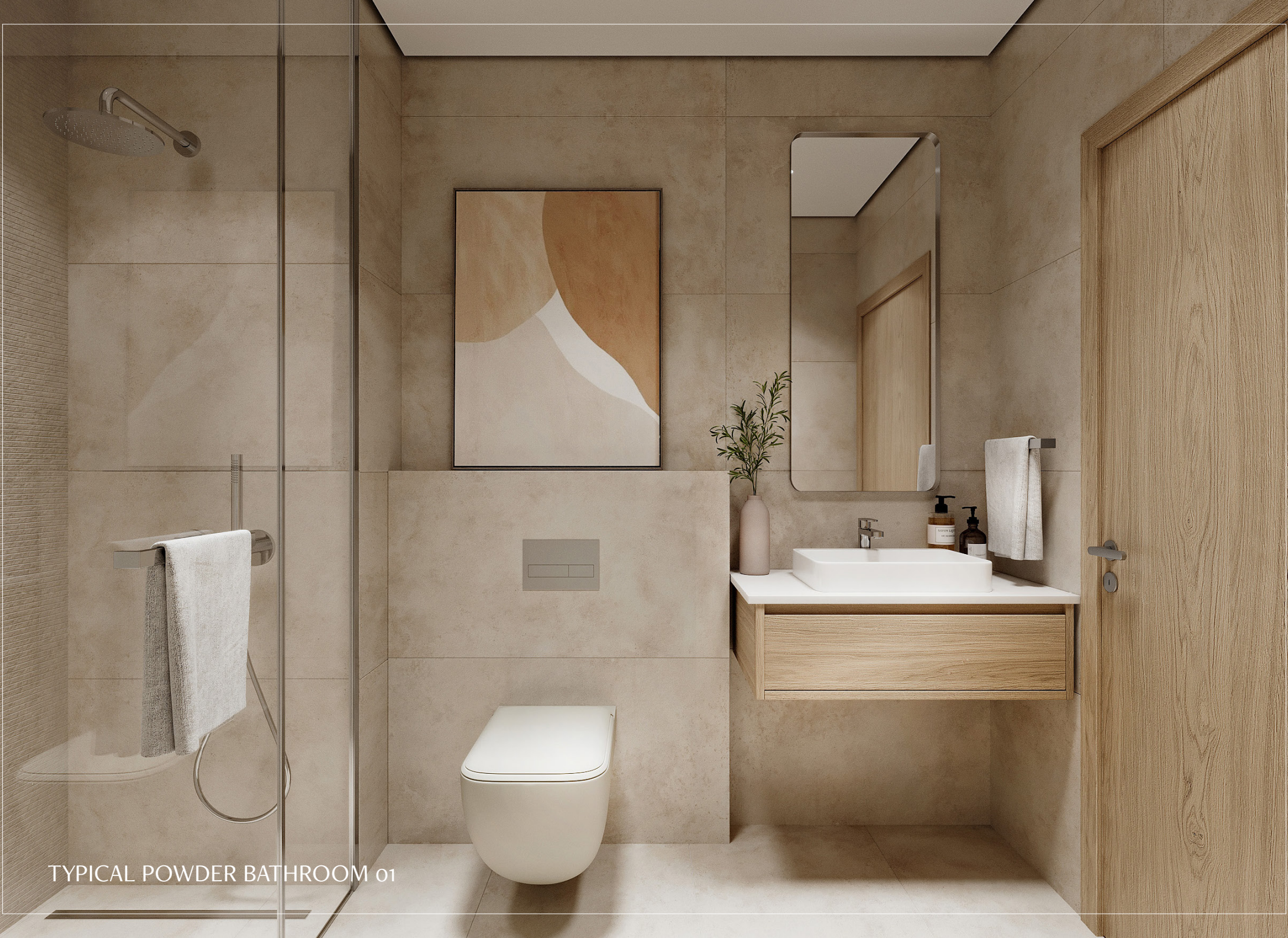
TYPICAL POWDER BATHROOM 01