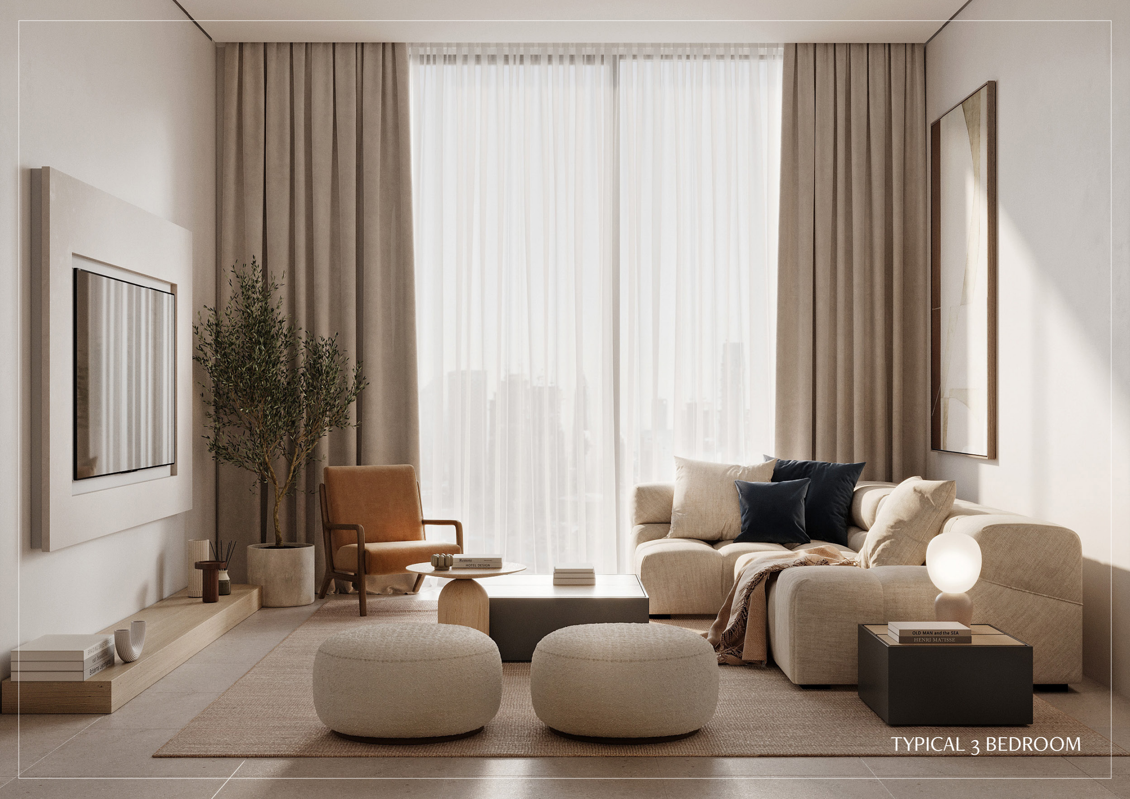
TYPICAL 3 BEDROOM