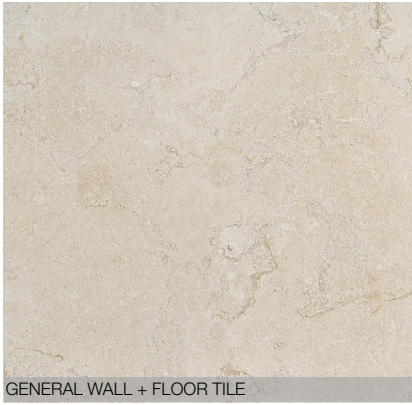
GENERAL WALL + FLOOR TILE