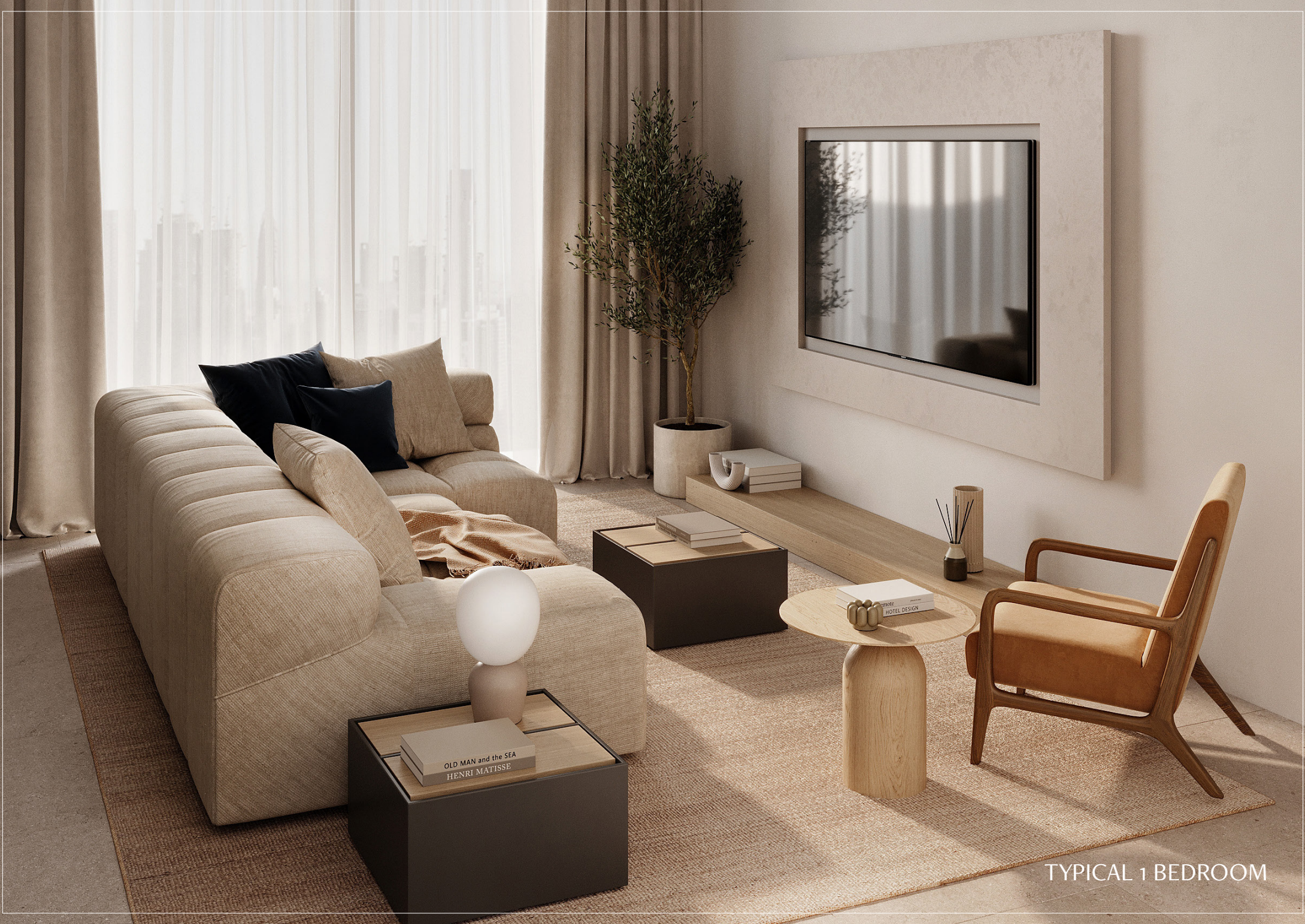
TYPICAL 1 BEDROOM