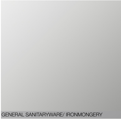
GENERAL SANITARYWARE/ IRONMONGERY