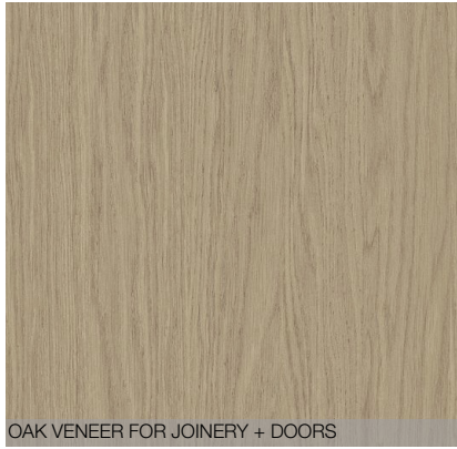
OAK VENEER FOR JOINERY + DOORS