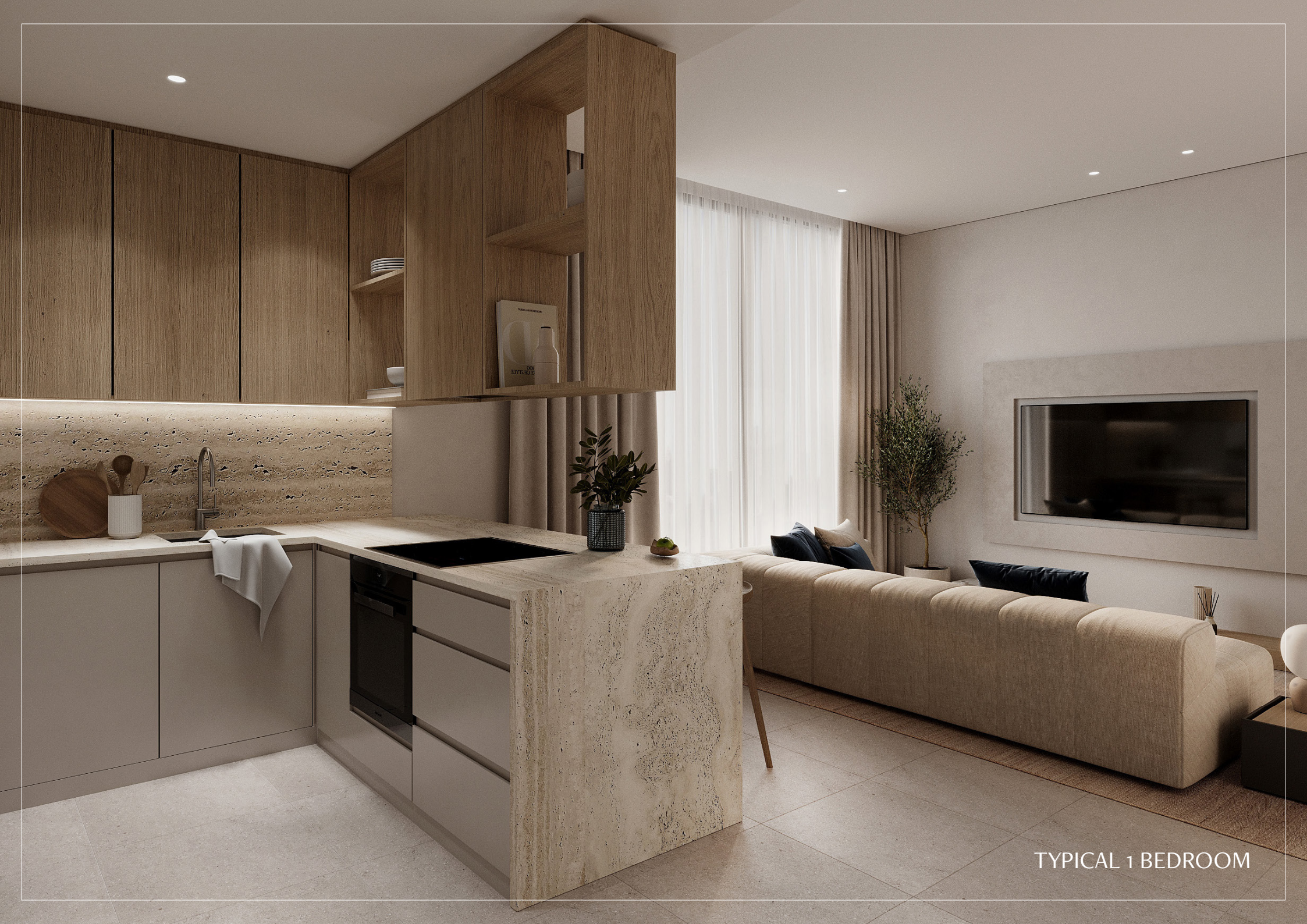
TYPICAL 1 BEDROOM