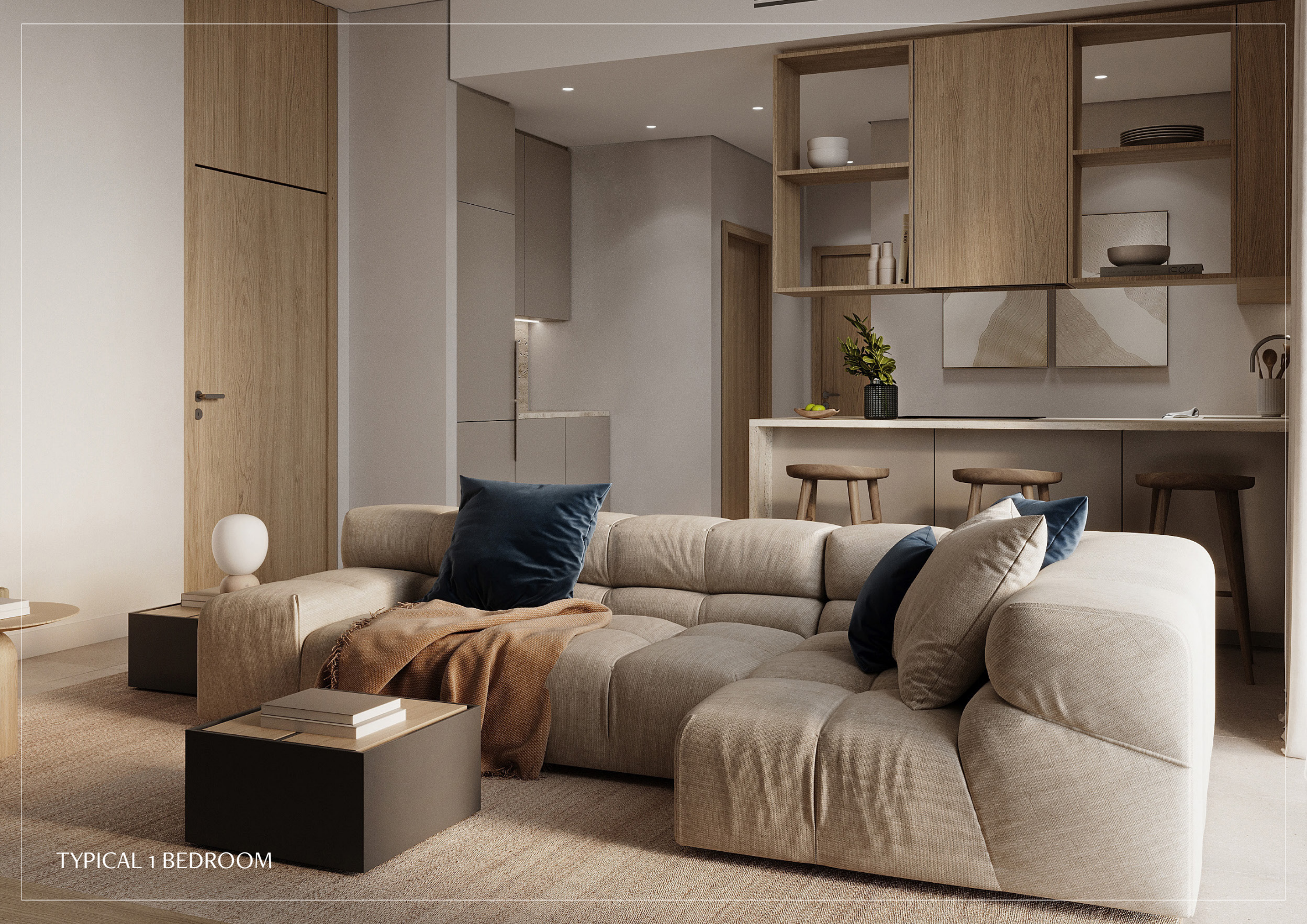
TYPICAL 1 BEDROOM