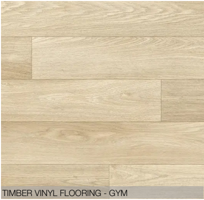
TIMBER VINYL FLOORING - GYM