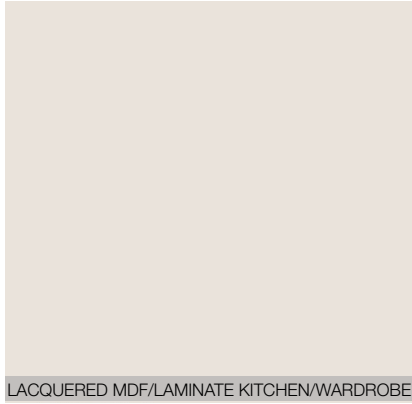
LACQUERED MDF/LAMINATE KITCHEN/WARDROBE