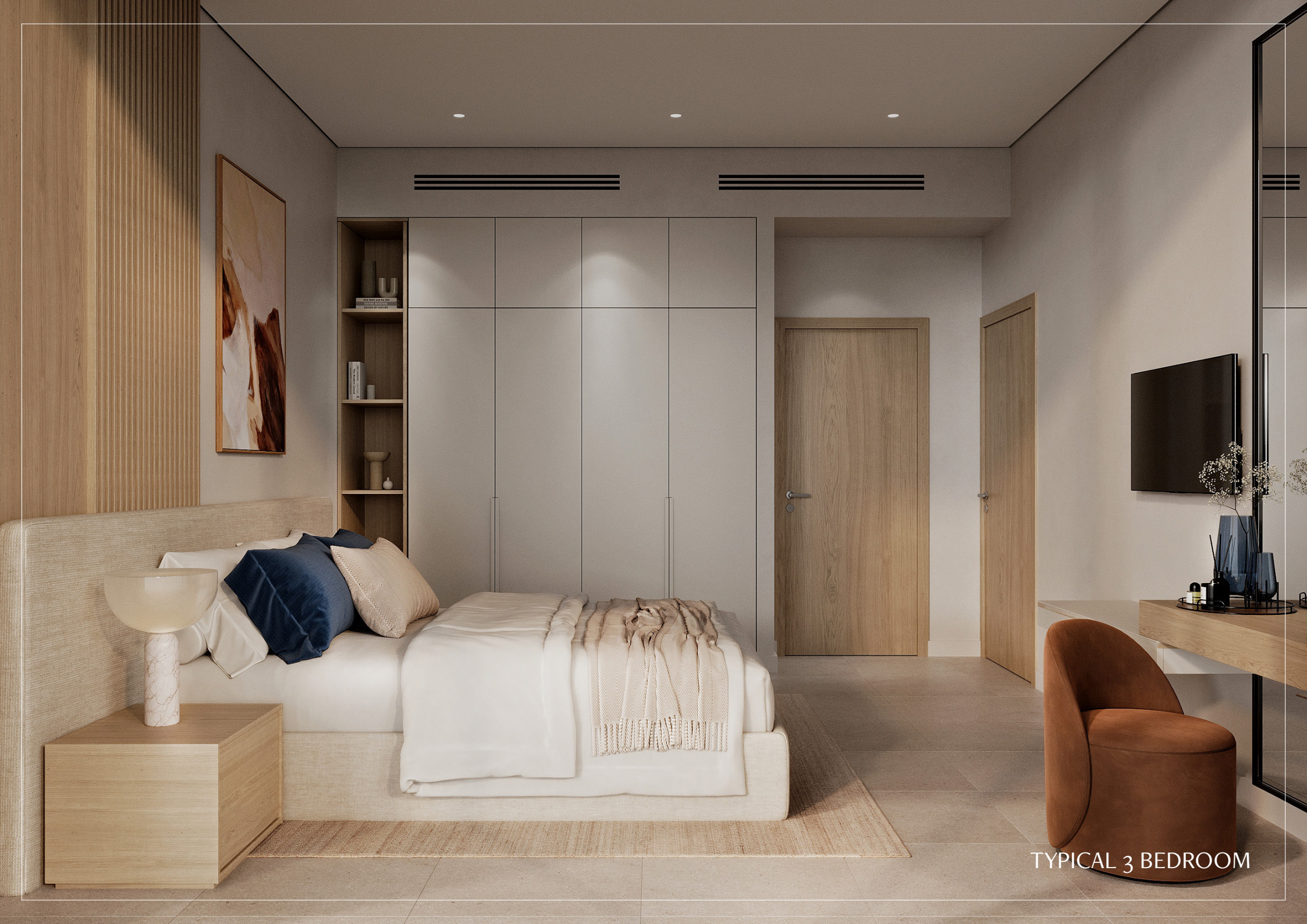
TYPICAL 3 BEDROOM