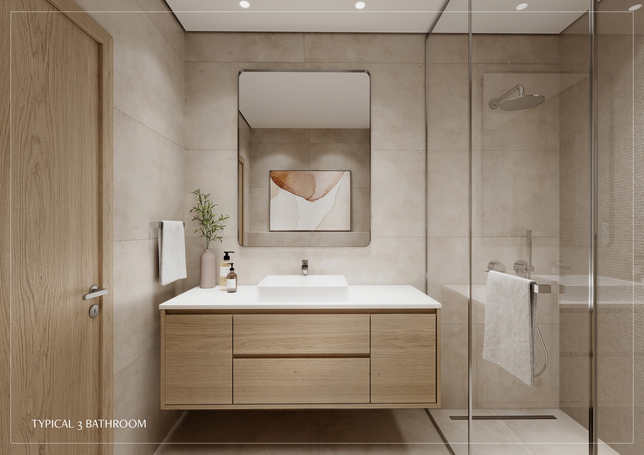
TYPICAL 3 BATHROOM