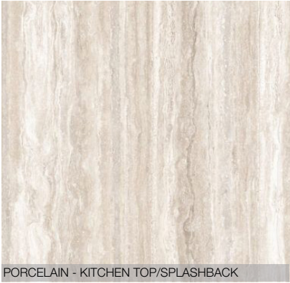
PORCELAIN - KITCHEN TOP/SPLASHBACK