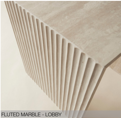
FLUTED MARBLE - LOBBY