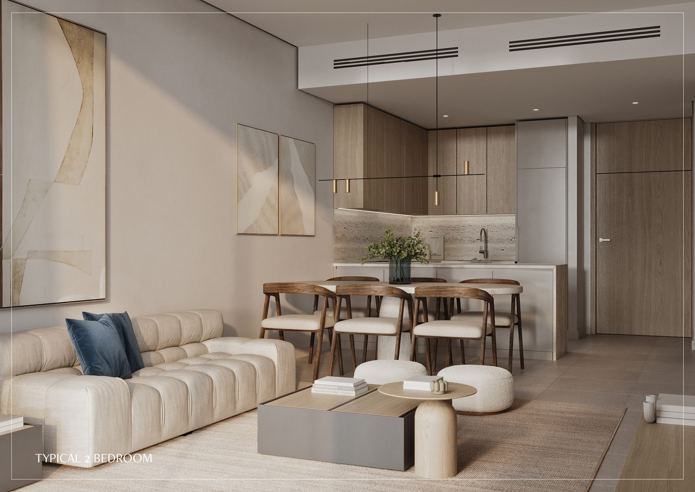
TYPICAL 2 BEDROOM