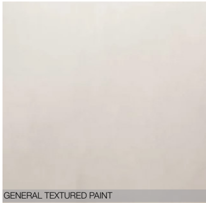
GENERAL TEXTURED PAINT